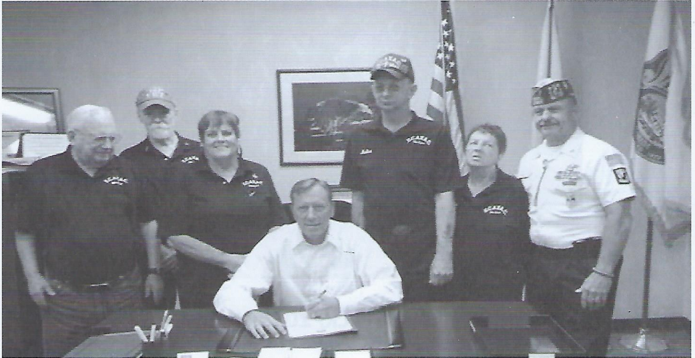
Island X-4, Orlando FL receiving Orlando City Mayors Proclamation for 2015 Veterans Day Parade