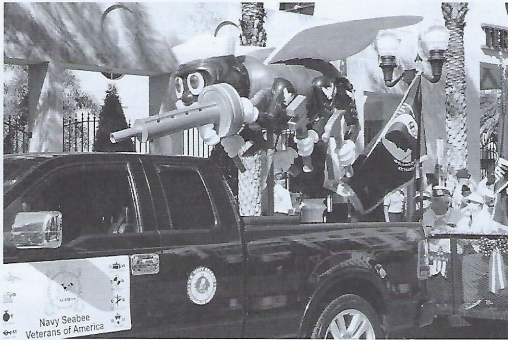
Orlando, Fl Island X-4 Lead Truck, 2015 Veterans Day Parade