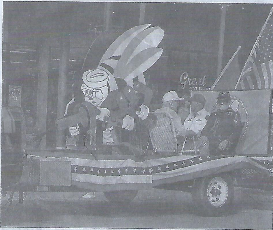
Navy veterans ride a float representing the U.S. Navy Seabees construction battalions down Woodland Boulevard on Saturday, Nov. 7, during the DeLand Veterans Day Parade.