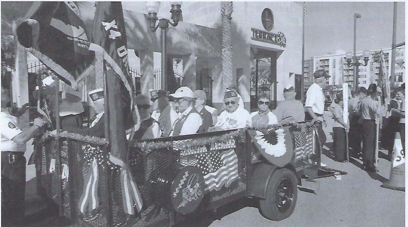
Island X-4, Orlando Veterans Day Parade Float 2015