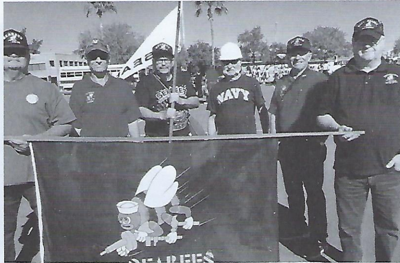
East Valley Veterans Parade, City of Mesa, AZ 11 Nov. 2015